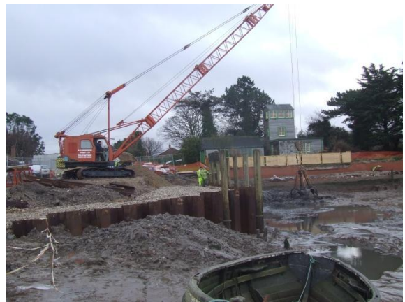
Dredging out silt using grab